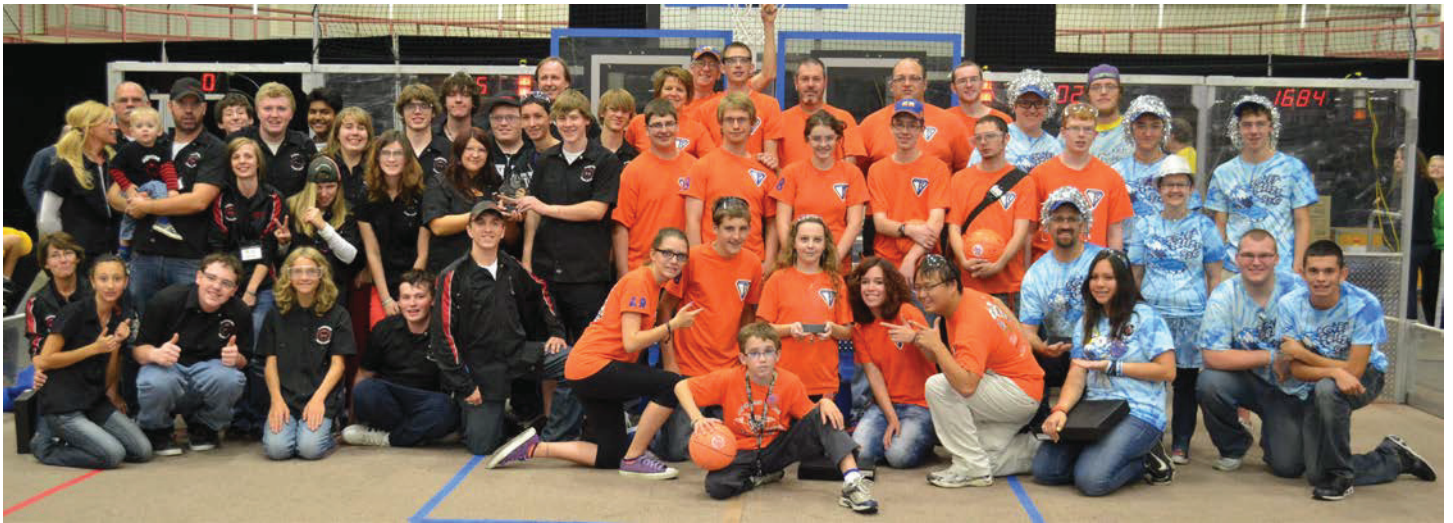
The Winning Alliance – FRC Team 2337, FRC Team 68, and FRC Team 910

New students from Truck Town Thunder were invited to come and watch the team compete. The Truck Town Thunder Robotics team has grown to 31 members and the Kettering Kickoff Competition is a great way to show new students a competitive robotics competition.